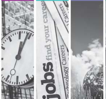
3 / 8 N

Visit the European Parliament website: http://www.europarl.europa.eu/studies